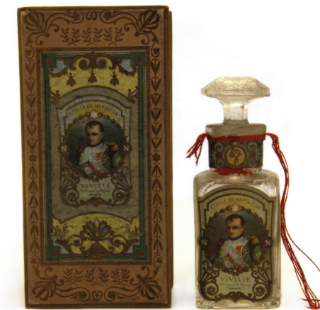
Étoile de Napoléon - Paris - Viville - 19th century

After a burgeoning trade in extravagant and elitist scents, the second half of the 20th century saw deep-rooted change: sales strategy in perfumery now targeted all social classes, resulting in sales prices being slashed, and costs decreasing as a result. Launch after launch followed suit, cashing in on this new-found popularity. Scent fashions and trends began rapid-cycling, stimulated by marketing and consumers hungry for new products. This thirst for newness had never felt as urgent. But for a handful of exceptions, perfumery shifted from the exceptional to the habitual, from an exclusive accessory to a mass-market product. Long neglected, scent became more popular than ever before, cropping up in food, household products, car air fresheners, offices and public spaces. And while a great many of these scents were designed to heighten pleasure, many were used to trigger desire and encourage buying.