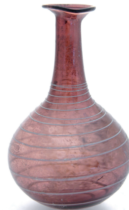
Piriform bottle - 2nd/3rd century BC - Syria - Blown glass

Under Julius Caesar, the body cult, with perfume serving as an essential accessory, reached its apex. In this polytheistic society, each divinity was even allocated their own fragrance. Rome may not have shown innovative flair in terms of creating new fragrances, but it popularised its use and revolutionised its transport and trade: lighter glass (blown or moulded) packaging was used for its air-tight qualities, dethroning earthenware as the go-to packaging.