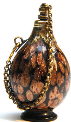
17th century Murano crystal bottle - Venice - silver-gilt base and stopper.

But the crusades and discovery of the New World ushered in a host of new raw materials. The powers of plants, spices and herbs were revered as proof of God's love in contrast to the stench caused by the great epidemics of the times. In this golden age of mysticism and symbolism, plants were allocated therapeutic virtues based on their colours and shapes.