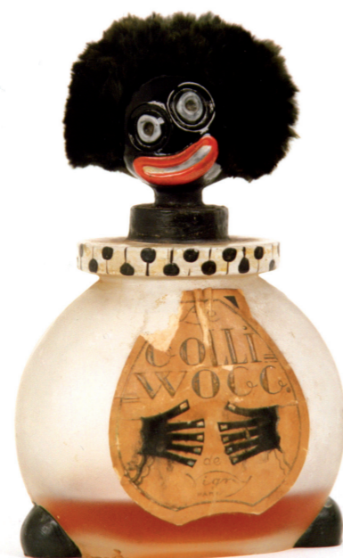
Goll Wogg bottle, Vigny - Glass - Franc

It also helps improve the museum's facilities in terms of lighting, purchasing furniture and technical equipment.