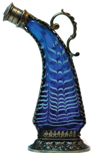
Early 18th century - pear-shaped bottle - Germany - Crystal, silver-gilt base and stopper.