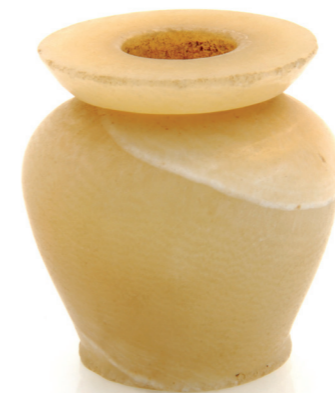
Ointment pot - Egypt, Middle Kingdom - Carved alabaster.

The word 'perfume' dates back millennia, taken from the Latin word perfumare , meaning 'by smoke', a necessary factor in its original use for sacred, medical, or ritual fumigations. From scents and perfume to fragrance: a story of sacredness and seduction.