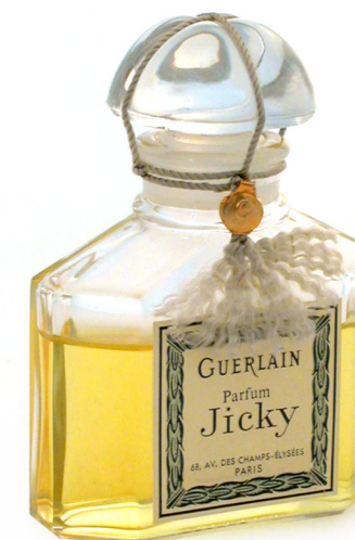
Jicky - Paris - Guerlain - 1889