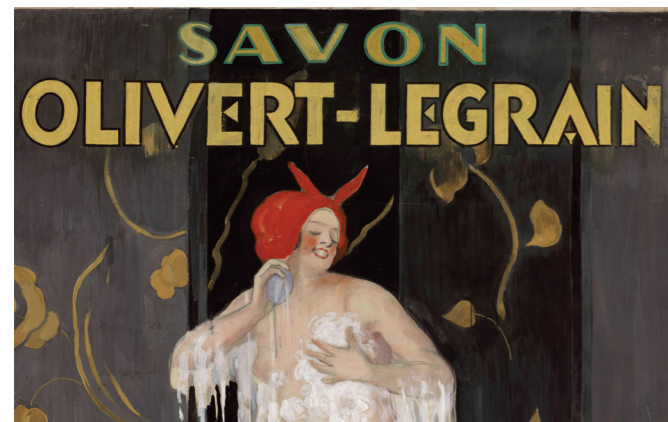
Olivert-Legrain soap poster - L. Capiello - 1920

And of course, perfume is the theme for many a private collection. But prior to the opening of the International Museum of Perfumery, no public establishment dedicated to safeguarding this heritage existed. Soap, make-up and cosmetics all fall under the remit of what we now consider to be perfumery, meaning luxury alcohol-based perfumery.