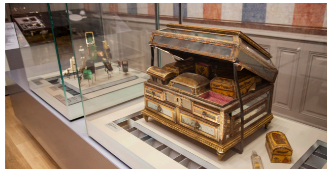
Grooming case - 18th century - Venice, wood, glass, carton, cloth, metal International Museum of Perfumery, inv. 94 48

Grasse wanted to be the first to found an International Museum of Perfumery, and the town put forward a well-researched scientific proposal, backed by a tenacious desire to see the project come to light.