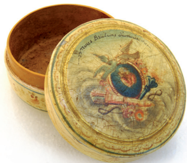
Bergamot box - Bergamot peel - France - wallpaper and varnish - 18th century

The resources centre is easily accessible to researchers.