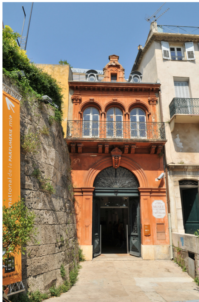
Facade of the Hugues-Ainé perfumery

But the popularity of scented products, developments in fragranced compositions, Grasse's exceptional expertise in natural products and the arrival of new companies thanks to expansions of larger ones, have resulted in Grasse being able to withstand the choppy economic waters of the times.