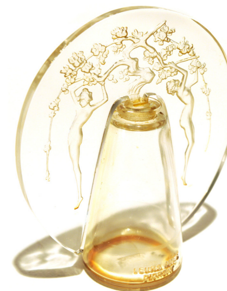
Leurs âmes - Paris - Lalique