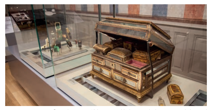
Grooming case – 18th century - Venice, wood, glass, carton, cloth, metal International Museum of Perfumery, inv. 94 48

Grasse wanted to be the first to found an International Museum of Perfumery, and the town put forward a well-researched scientific proposal, backed by a tenacious desire to see the project come to light.