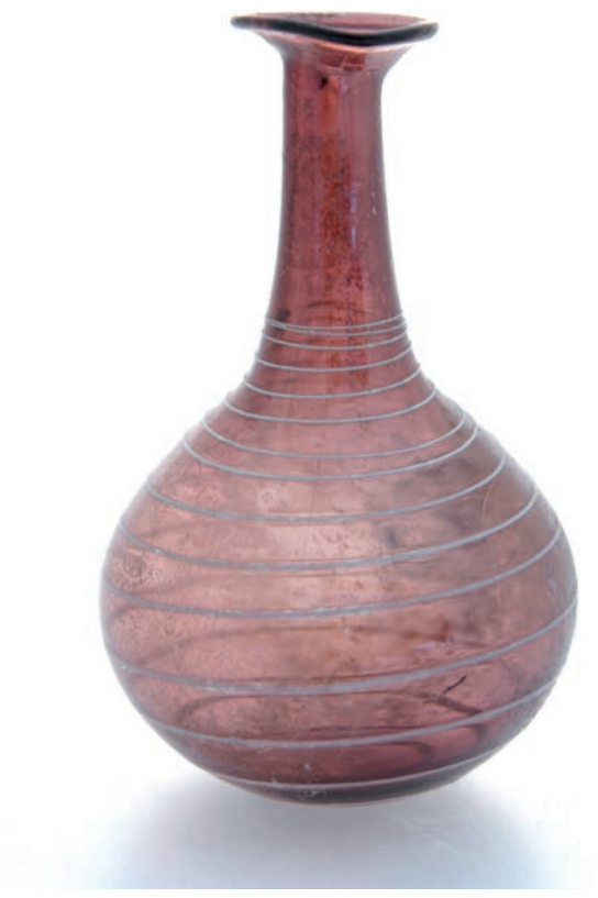
iriform bottle - 2nd/3rd centurv BC - Svria - Blown alass

Under Julius Caesar, the body cult, with perfume serving as an essential accessory, reached its apex. In this polytheistic society, each divinity was even allocated their own fragrance. Rome may not have shown innovative flair in terms of creating new fragrances, but it popularised its use and revolutionised its transport and trade: lighter glass (blown or moulded) packaging was used for its air-tight qualities, dethroning earthenware as the go-to packaging.