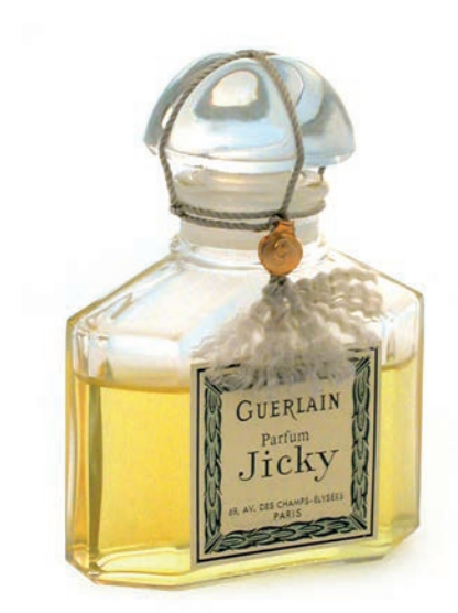
Jicky - Paris - Guerlain - 1889