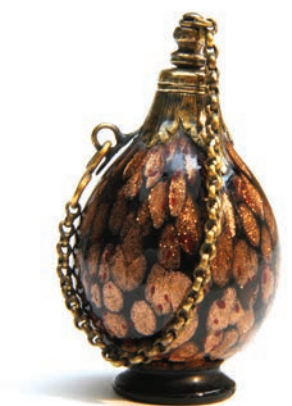
17th century Murano crystal bottle - Venice - silver-gilt base and stopper.

But the crusades and discovery of the New World ushered in a host of new raw materials. The powers of plants, spices and herbs were revered as proof of God's love in contrast to the stenches caused by the great epidemics of the times. In this golden age of mysticism and symbolism, plants were allocated therapeutic virtues based on their colours and shapes.