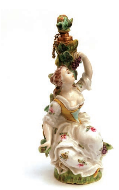
Figurine bottle in the shape of a young woman picking a bunch of grapes – Chelsea Porcelain - 18th century