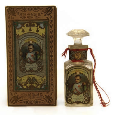
Étoile de Napoléon - Paris - Viville - 19th century

After a burgeoning trade in extravagant and elitist scents, the second half of the 20th century saw deep-rooted change: sales strategy in perfumery now targeted all social classes, resulting in sales prices being slashed, and costs decreasing as a result. Launch after launch followed suit, cashing in on this newfound popularity. Scent fashions and trends began rapid-cycling, stimulated by marketing and consumers hungry for new products. This thirst for newness had never felt as urgent. But for a handful of exceptions, perfumery shifted from the exceptional to the habitual, from an exclusive accessory to a mass-market product. Long neglected, scent became more popular than ever before, cropping up in food, household products, car air fresheners, offices and public spaces. And while a great many of these scents were designed to heighten pleasure, many were used to trigger desire and encourage buying.