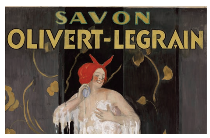
Olivert-Legrain soap poster - L. Capiello - 1920

And of course, perfume is the theme for many a private collection. But prior to the opening of the International Museum of Perfumery, no public establishment dedicated to safeguarding this heritage existed. Soap, make-up and cosmetics all fall under the remit of what we now consider to be perfumery, meaningluxuryalcohol-basedperfumery.