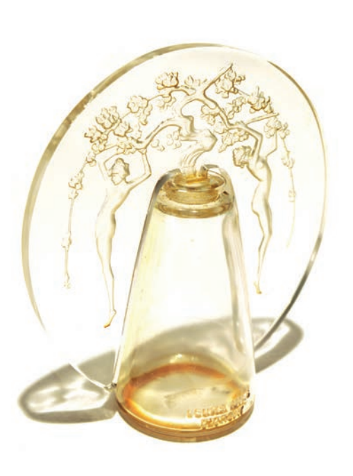
Leurs âmes - Paris - Lalique