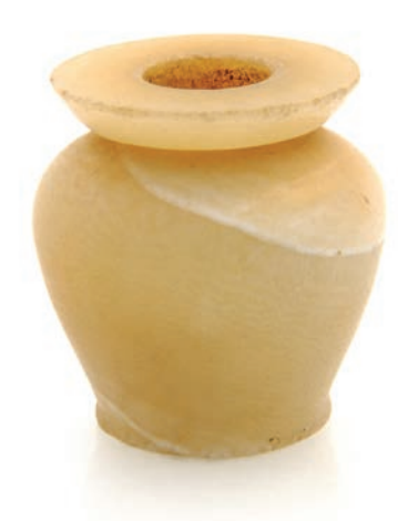
Ointment pot - Egypt, Middle Kingdom - Carved alabaster.

he word 'perfume' dates back millennia, taken from the Latin word perfumare , meaning 'by smoke', a necessary factor in its original use for sacred, medical, or ritual fumigations. From scents and perfume to fragrance: a story of sacredness and seduction.